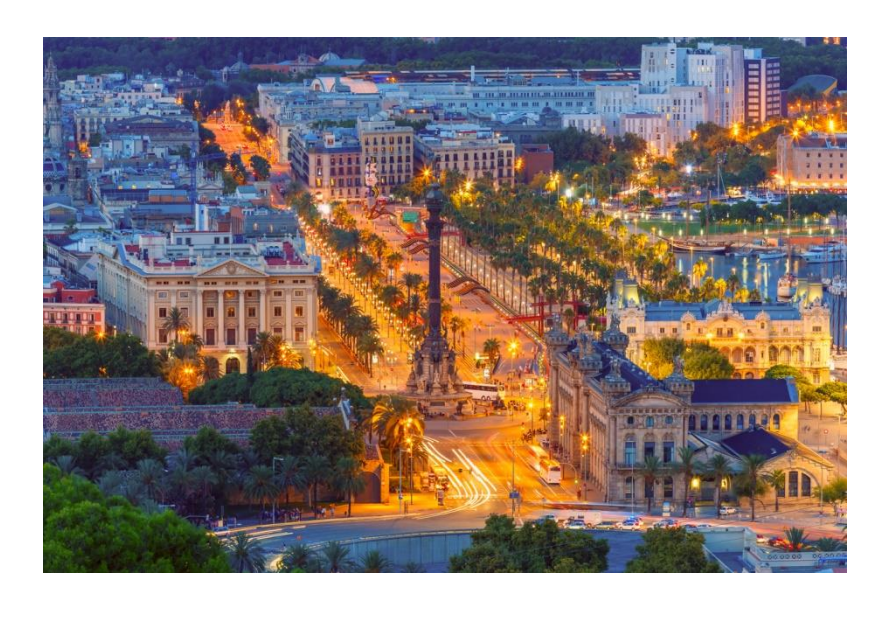
Barcelona, 22-25 October Hotel Arts Barcelona