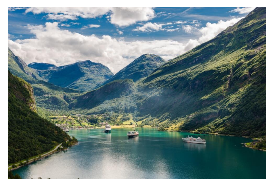
Oslo, Norway 25-27 May 2018